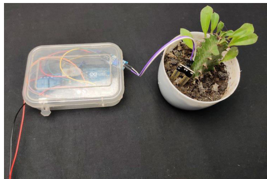
Figure 2: Arduino based Automatic Irrigation System

The system successfully reduced water wastage and ensured proper irrigation.